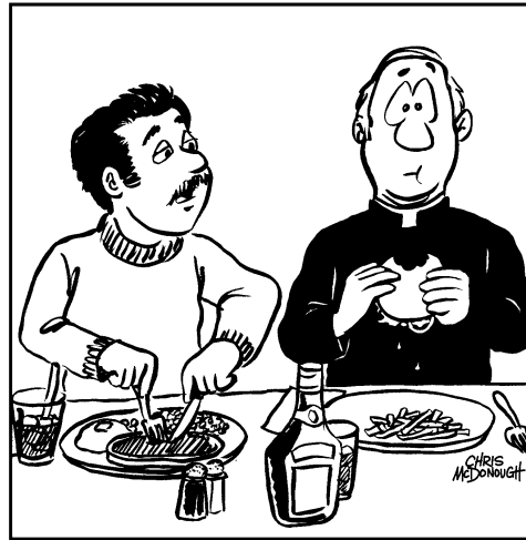
"I don't feel so bad having this steak seeing you eat that burger on a Friday in Lent."