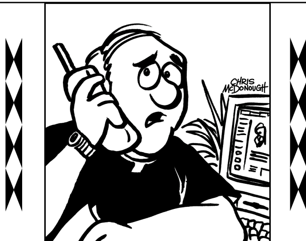
"When I said 'Fish on Fridays', Bob, I didn't mean during Lent you skip work on Fridays and go fishing."