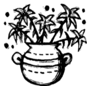
EASTER FLOWERS

This Easter Season the Art & Environment Committee is asking for your help with donations of flowers and decorating the Church. Please donate yellow and white cut flowers (especially Calla Lilies) and drop them off at the Parish Center