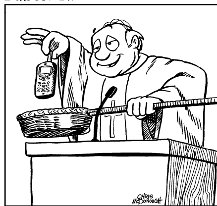
"We've a new weekly collection. Drop your cell phone in the basket and then pick it up when Mass is ended."

© 2003 W.P. a division of J.S. Paluch Co., Inc.