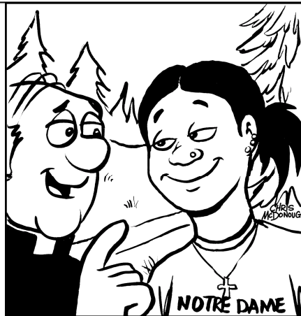
"In college, remember, just as important as your grade point average is your grace point average."

BAPTISMAL PREPARATION CLASSES: Every 2nd Saturday of the month at 10:45 AM in the Parish Center. Registration required. Call the Parish Center to reserve your space.