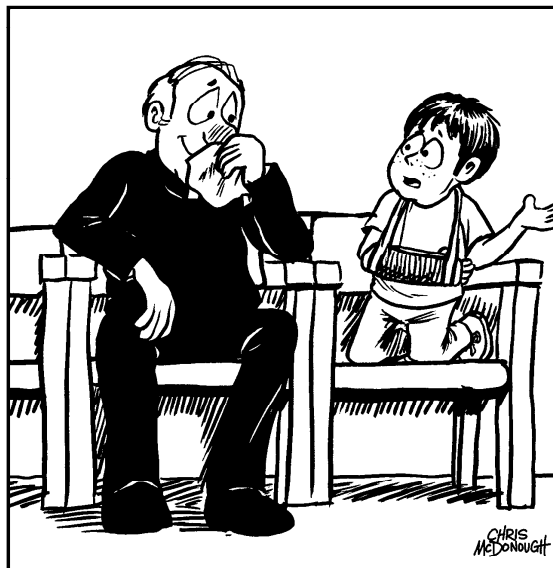
© 2003 WLP a division of J.S. Paluch Co., Inc.

"...what do the angels say when God sneezes?"