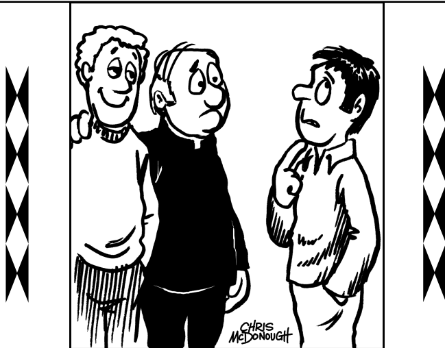
"He learned about our faith from RCIA? I don't know if my cable company carries that channel yet."

"The worthy priest is ... the living image of Christ in this world," said St. Jean Eudes (1601-1680). The Archdiocese recently received a letter from Rhode Island and a check for a hundred dollars "as a gift for your diocese." The gentleman who wrote had been traveling in July, and at the airport in Washington DC he fell into conversation with another traveler who was heading home to San Francisco: "His flights had been delayed several times," wrote this stranger, "but his disposition was calm and peaceful. I had a pleasant conversation with him, and I only learned that he was a priest of the San Francisco archdiocese at the very end of our conversation. I did not learn his name. But how blessed we are to have him! I wish to salute him and the Holy Church for his priesthood. God bless you and the young priest I met, and thank you for your service to God." What a welcome reminder, as summer ends, travelers come home, schools open, and we settle back into our routines, of "how blessed we are" every day in the men and women who serve our communities as clergy and religious. Thank you all for your service to God on our behalf.