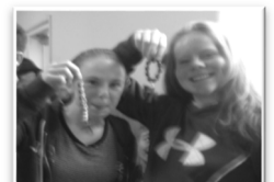
Confirmation Candidates made prayer beads and designed pillow cases at Our Lady of Mercy on October 16th.