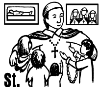
St. Vincent de Paul

Next week, March 29-30 , our parish will take up The Catholic Relief Services Collection. Funds from this collection provide food to the hungry, support displaced refugees, and bring Christ's love and mercy to vulnerable people here and abroad. Next week, please give generously to the collection and reveal Christ's love to those most in need. There are envelopes in the church for your kind consideration. Learn more at www.usccb.org/catholic-relief .