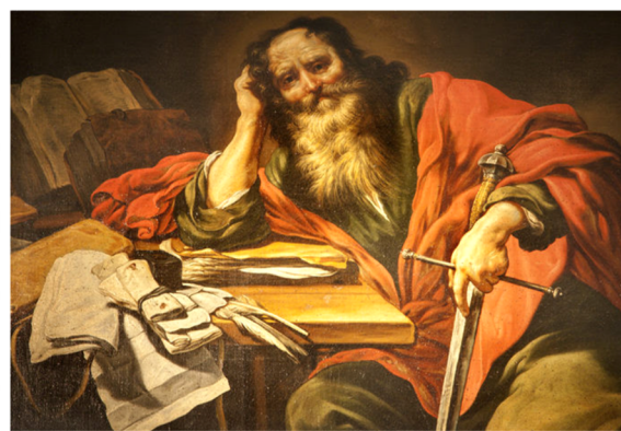
St. Paul paint from Paris, St. Severin Church

Today's Readings: Ez 2:2-5; Ps 123:1-2, 2, 3-4; 2 Cor 12:7-10; Mk 6:1-6