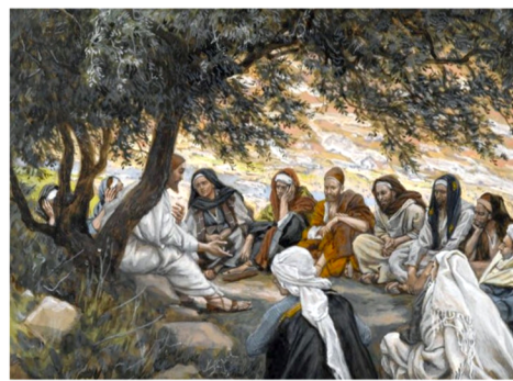
Jesus Christ Exhortation to the Twelve Apostles James Tissot

Today's Readings: Wis 2:12, 17-20; Ps 54:3-4, 5, 6, 8; Jas 3:16-4:3; Mk 9:30-37